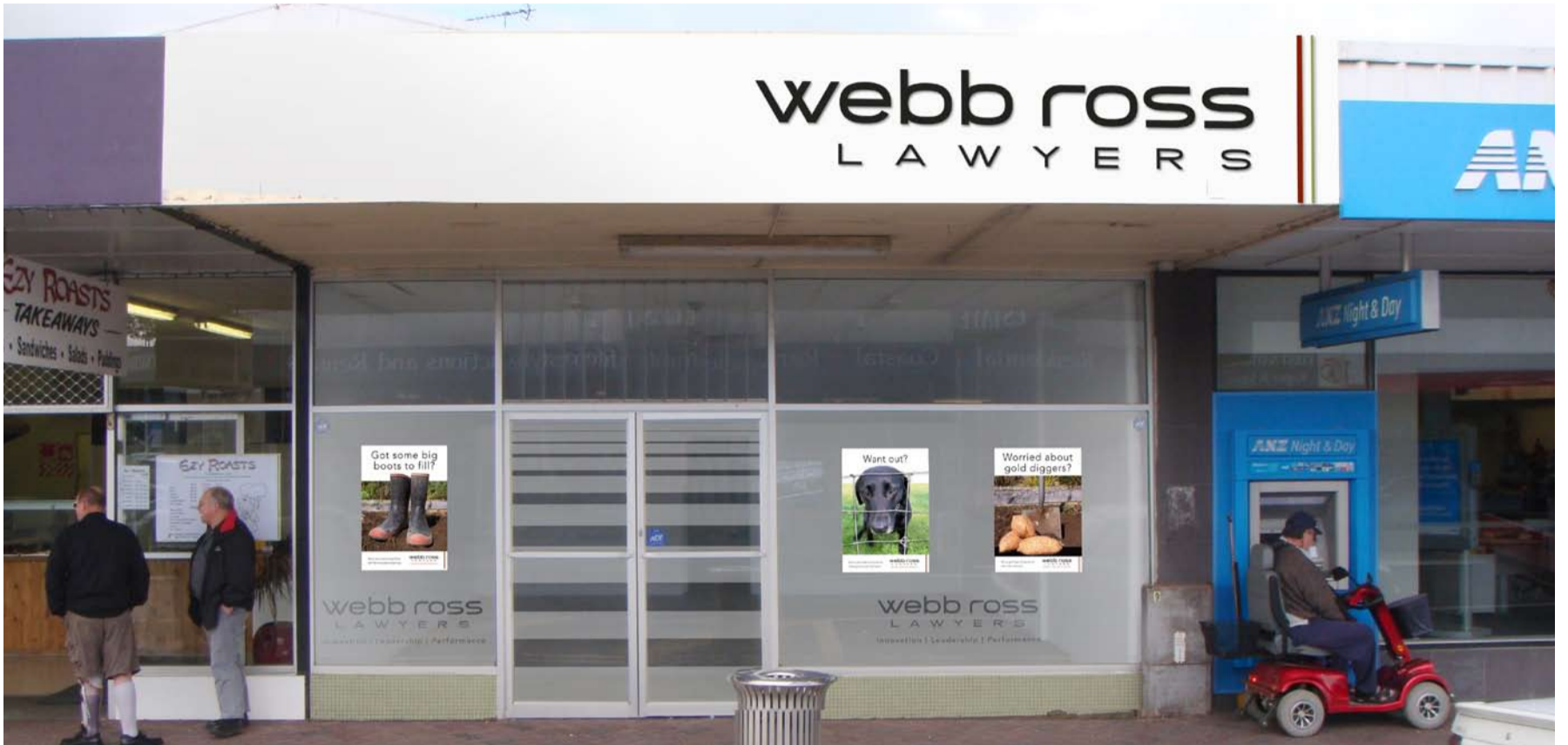
The new Webb Ross premises at 109 Victoria Street, Dargaville

Webb Ross Lawyers is fairly iconic in Whangarei and was initially formed by the merger of Johnson Hooper and Webb Ross & Co in 1990. A second merger with the firm of Thorne Dallas & Partners in 2006 made it Northland's largest law firm. It's also one of the longest serving practices as all the firms have considerable histories in the north dating back to the 1930s.