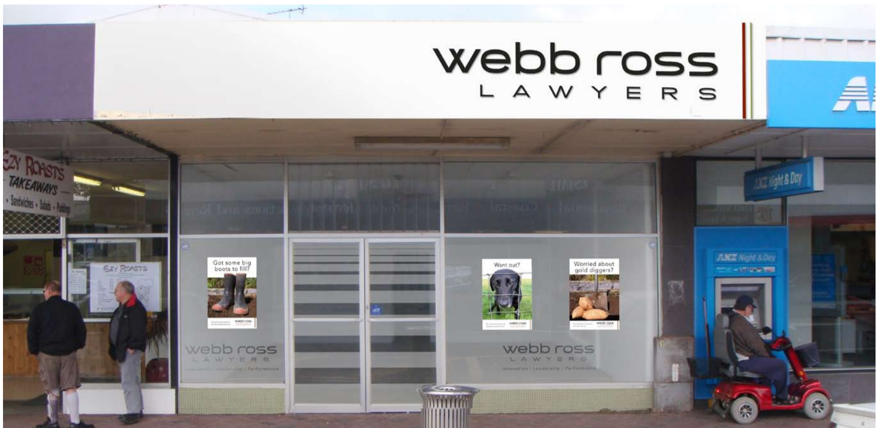
The new Webb Ross premises at 109 Victoria Street, Dargaville